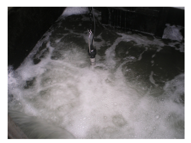
Figure 2: IQ SensorNet VARiON Sensor in Final Effluent

facilities are small facilities serving institutions that also have a limited budget. Even better is a tool that pays for itself by enabling reduced O&M costs for energy or chemical inputs.